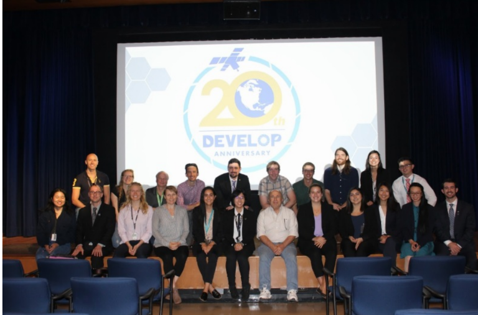
DEVELOP team members both past and present at a recent 20 Year anniversary event at NASA's Jet Propulsion Laboratory.