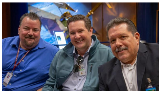
Far West Contractors Team

JPL is pleased to recognize Far West Contractors Corporation as the Small Business Subcontractor of the Year for its significant contributions to the Laboratory's infrastructure. Congratulations!