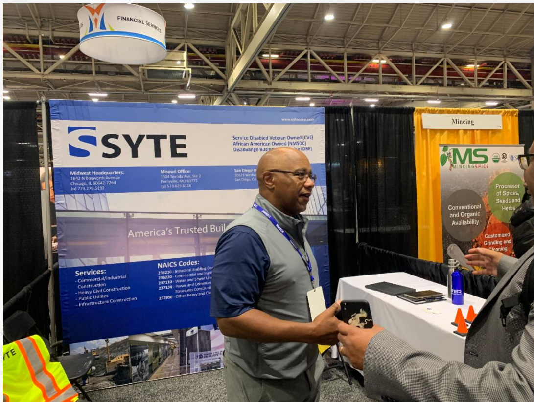
Networking at NMSDC.